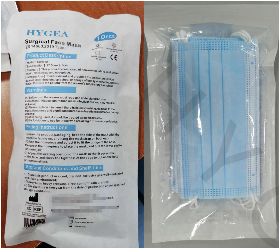
Verpackungseinheit: 10 Stück